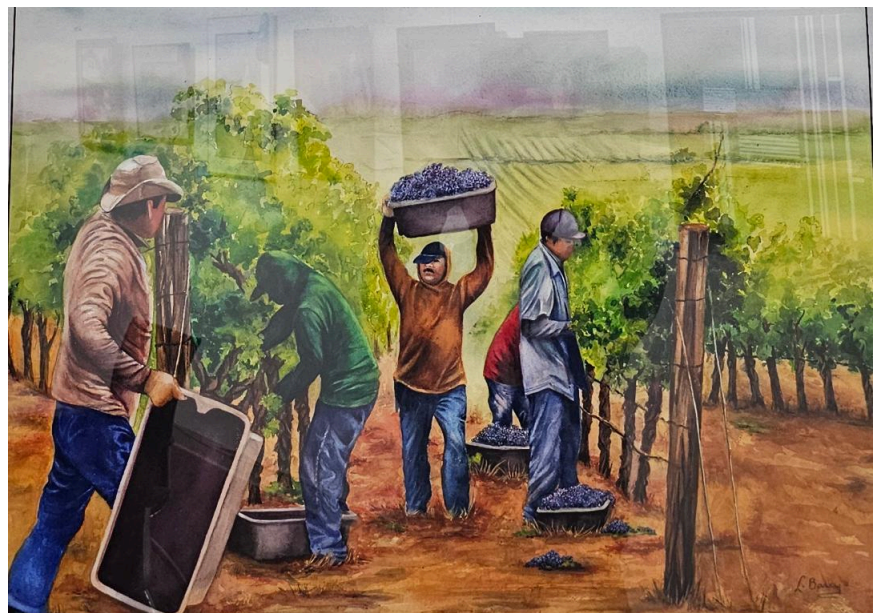
2 nd Place Watercolor Early Morning Harvest by Lorraine Barry