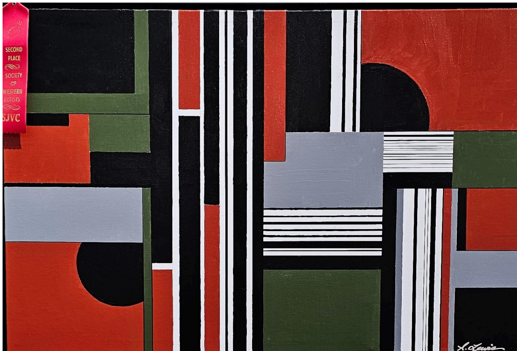
2 nd Place Non-Representational UDDG-The Build by Sheryl Lewis