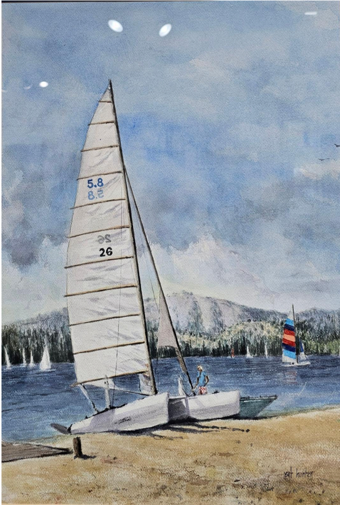
1 st Place Watercolor Huntington Respite by Pat Hunter