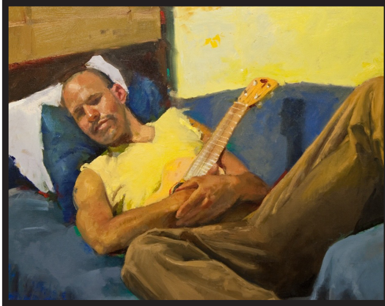
Best of Show “Ukulele Nap,” oil by Bob Gerbracht, SWA