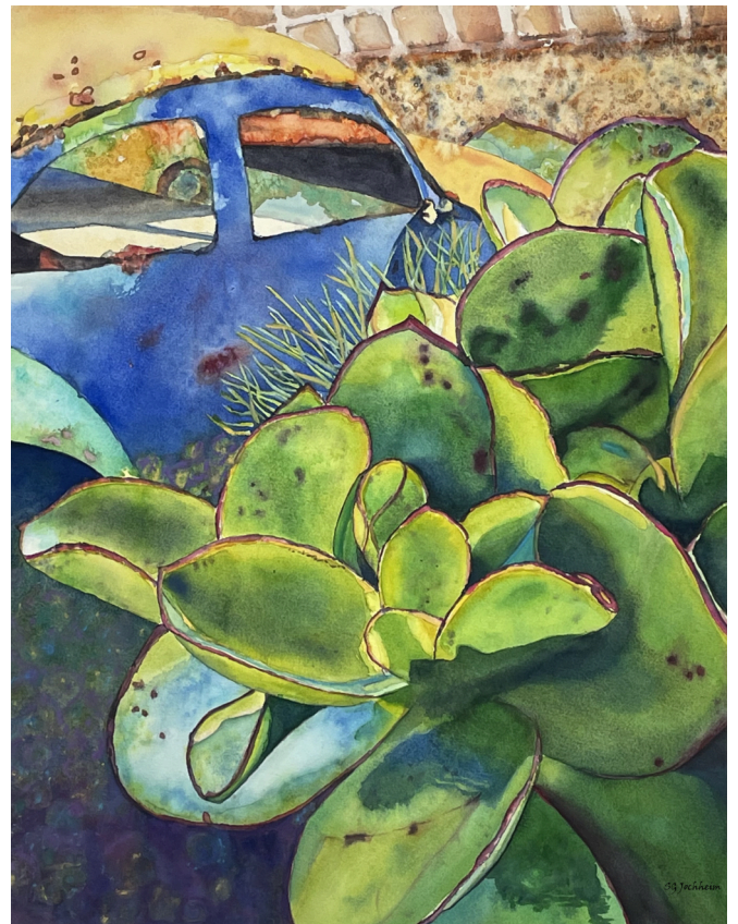
Oh No, There's a Bug in My Garden

was the recipient of an the Mijello Sponsor award from the California Watercolor Association's 54 th National Exhibition. She received a $500 gift certificate.