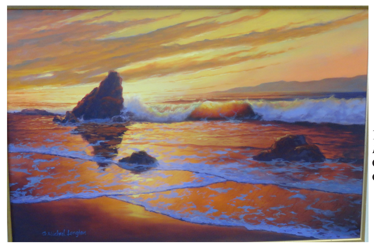
1st Place Oil Fanta-Sea Oil by Gary Langdon